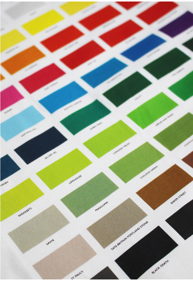
Tate's 'Colours of London' printed organic t-shirt.