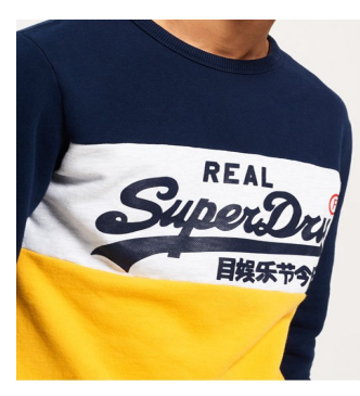
Tri-panel hoodie & sweat designs became a top-selling item in the University sector.

Our team of expert designers continually look at the latest fashion and high street trends that can be replicated into new product ideas for your brand to create merchandise that is 'on-trend' and guaranteed to sell. This includes the latest styles, colours, techniques and materials.